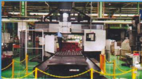
Okuma-3 Axis (4050X2600 mm)