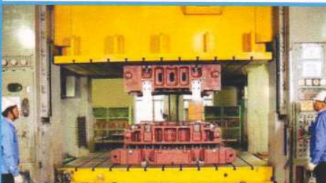
Komatsu 800T Trial Press (3300X2600 mm)