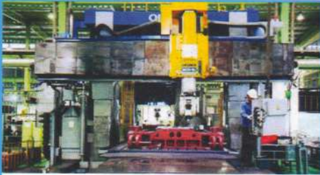
Okuma-5 Face (5000X3000 mm)