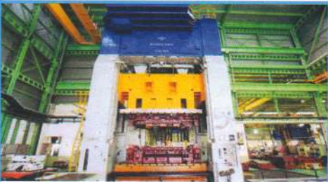
Komatsu 1000T Trial Press (4000X2100 mm)